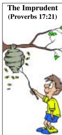
The Imprudent (Proverbs 17:21)

These mothers can share the blame with their husbands and pastors who have neglected to apply God's Word in their families. Thus their sons and daughters are lacking the key biblical qualities of wisdom and discipline that