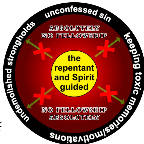
Top View of Funnel

Avoid Fellowship With Funnel Side-Clingers • Hardened, Mocking & God-denying Fools (see pages 9-11: “A Hebraic Perspective: Growing Wise and Remaining Teachable” < https://restorationministries.org/download/10.lesson10.pdf >) • Those who use arguments and pretensions (see pages 30-32: “How Does A Stronghold Obstruct Your Spiritual Life?” < https://restorationministries.org/download/demolishing-strongholds.pdf >) • Codependent relationships “Replacing Apprehension With Love” < https://restorationministries.org/download/19.dec22-05%20(1).pdf > (also see pages 33-38: “Dire Consequences If You Don’t Confront” < https://restorationministries.org/download/grtcr.pdf >)