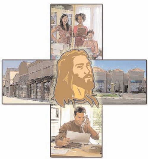
Ministering From Your Business

A business discovers what people need and seeks to make a profit through meeting that need.