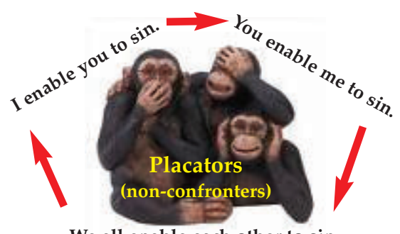
We all enable each other to sin.

As a result Christendom today is becoming a placation culture— iniquity and sin <u>within fellowships</u> are unconfronted. Placation is due largely to the influence of the Sodom Factor among those who call themselves Christian but tolerate compromise. It operates something like the monkey diagram: