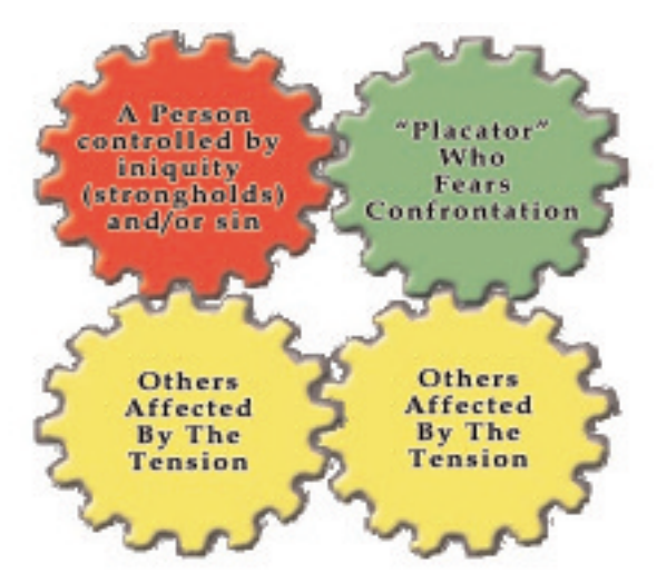
If you remember, from our workbook Demolishing Strongholds :

In our book Growing Relationships Through Confrontation (a free download and a must read!!!) we describe the gears of co-dependency . We've adapted them here to show you how placators, who fear con frontation , are permitting the iniquity of strongholds and/or sin to hurt others.