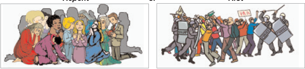
Produced by Restoration Ministries International • A Gift-supported ministry (1 Cor. 9:11) • www.restorationministries.org

When Famine Comes, What Will YOU Do? Repent or Riot