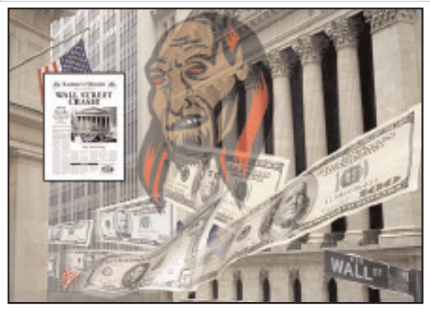
1. Any greed within you displays distrust that God will ultimately provide for you.

From our God's perspective, the sin of greed slaps His face. Biblically, greed is idolatry , compromising your trust in the One True God with hunger for the things the world treasures. Have we learned nothing from the piteous example set us by the grumbling Israelites in the desert who tainted their experiences of God with the ways of the pagan world? (See 1 Corinthians 10:1-14.) It's not what we say that validates our life in Christ, but how we live .